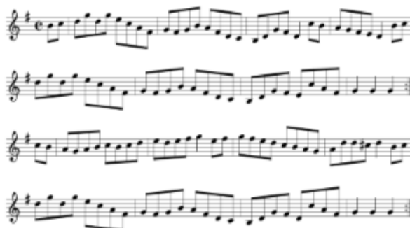
The SPRING GARDEN (hornpipe)

~ For newsletter items or suggestions, call or text Maureen Woods (978) 518-0436 or email mo.woods@comcast.net ~